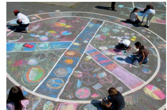
Valley View E.S., Photo: Dumas/Aaron