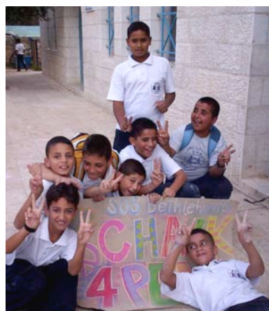
SOS Herman Gmeiner School

Official color of CHALK4PEACE: 2008- PURPLE 2007- GREEN 2006- ORANGE