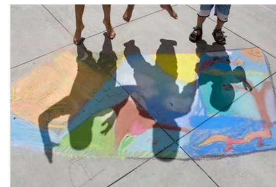
Cragmont E.S., Berkeley, CA