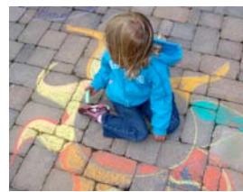
Geneva, NY

CHALK4PEACE has received major support from the Arlington Arts Commission, VA D.C. Commission for the Arts & Humanities Pasadena Community Foundation, CA Boulder Arts Commission, CO